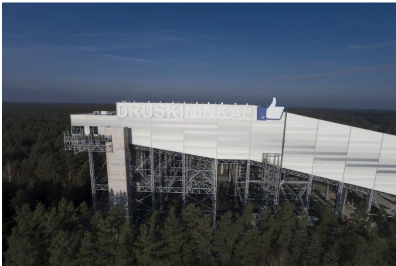
The biggest in the world LIKE officially unveiled 7 November on the Snow Arena in Lithuanian resort Druskininkai