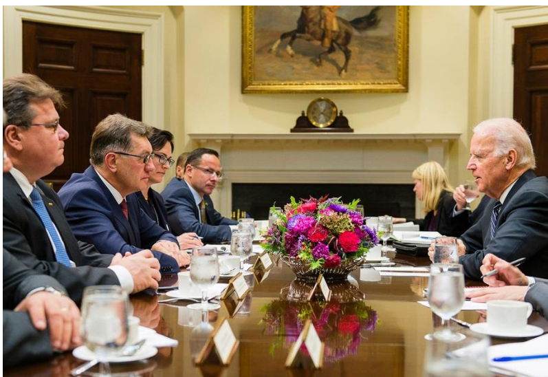
On 10 October in Washington, D. C., Lithuanian Prime Minister Algirdas Butkevičius accompanied by Foreign Minister Linas Linkevičius met with U.S. Vice President Joe Biden.